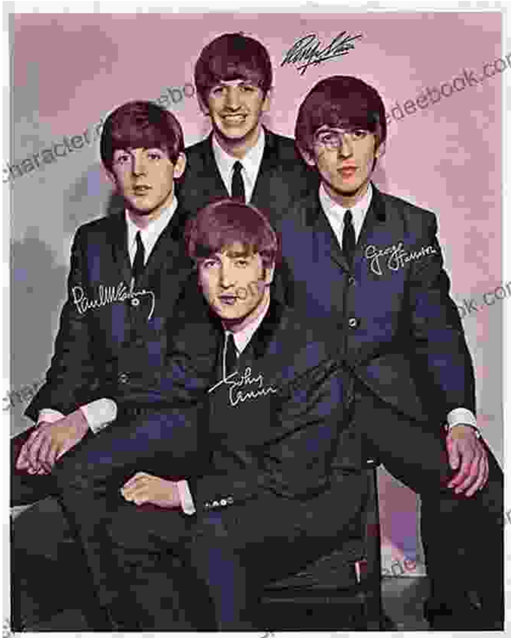
A photograph of The Beatles.

Today, English music is more diverse than ever before. There are musicians from all over the world living and working in England, and they are bringing their own unique influences to the British musical landscape.