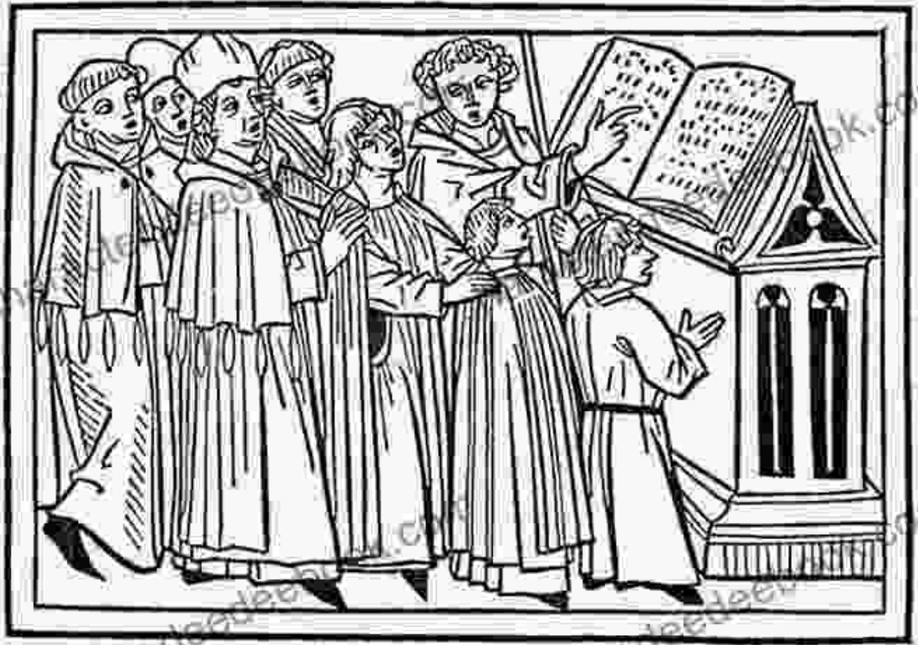
A medieval choir singing a motet.

The Renaissance saw a further flowering of English music. Composers such as William Byrd and Thomas Tallis wrote some of the most beautiful and enduring music of the period. They were inspired by the Italian Renaissance, but they also developed their own unique style.