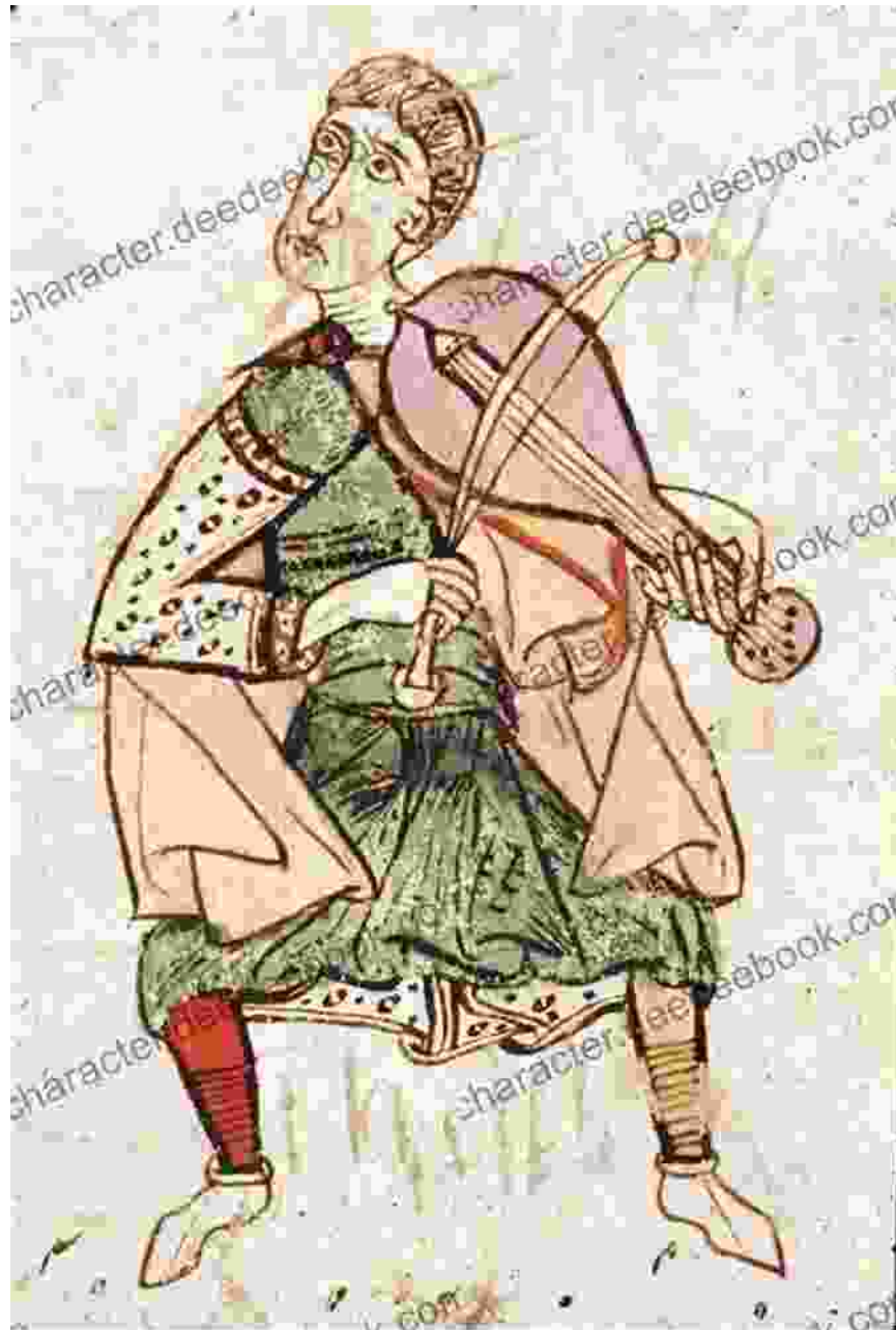
Anglo-Saxon musicians playing traditional instruments.

The Norman Conquest of 1066 brought a new wave of musical influences to England. The Normans were skilled musicians, and they introduced new instruments and styles of music to the island. The troubadours, who were wandering minstrels, became popular in the Norman court, and their songs of love and chivalry were soon adopted by the English.